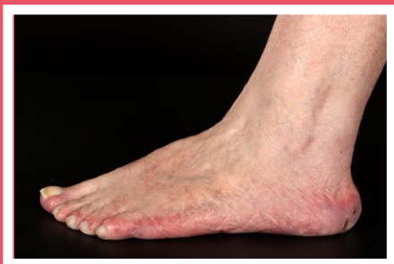
How a cracked heel can look